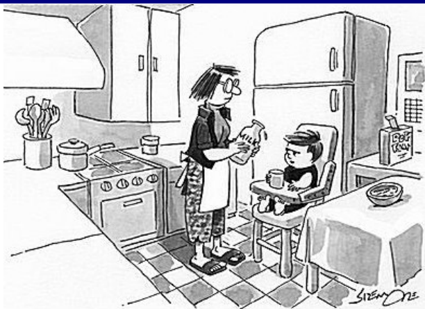
"Leave the bottle."